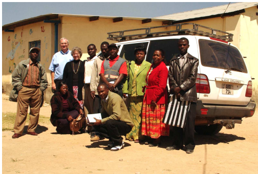
Training Leaders in Choma