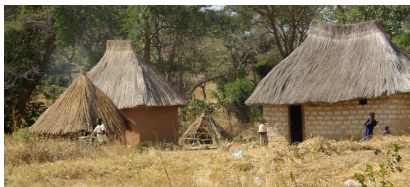
Village in Southern Province

Christianity has been in Zambia for over 100 years, having been introduced by David Livingstone in the mid-1800's. Response to the Gospel was initially very slow. Less than 2% of Zambians had declared themselves to be Christians and had been baptized by 1930. This number increased to about one-third by the 1960's and has exploded during the last few decades. Today the majority of Zambians call themselves "Christian," and for the past twenty years the nation's official religion has been Christianity.