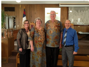
Green City with Coonfields