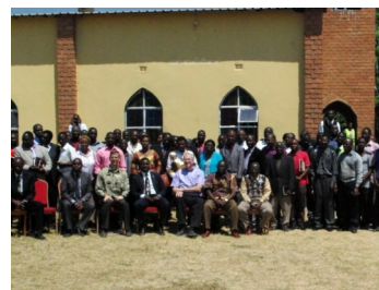
National AG Conference