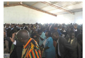
A/G "Big Sunday"