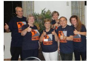
Our Zambia team