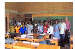
Students taking Corinthians

JULY - DECEMBER: Back to Zambia and all that God has in store for us and the work here.