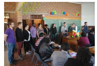
Team from Bellevue