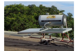
Our new solar water heater