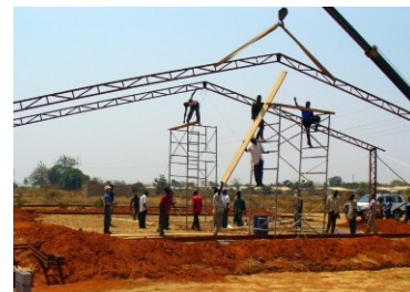
Two tabernacles as they were being constructed