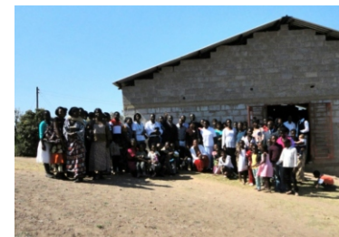
Tabernacles in Bauleni and Chilanga after the walls were put up