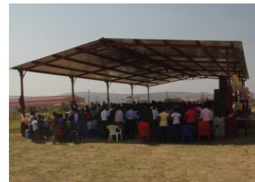
The dedication services for tabernacles in Liteta and Kafue