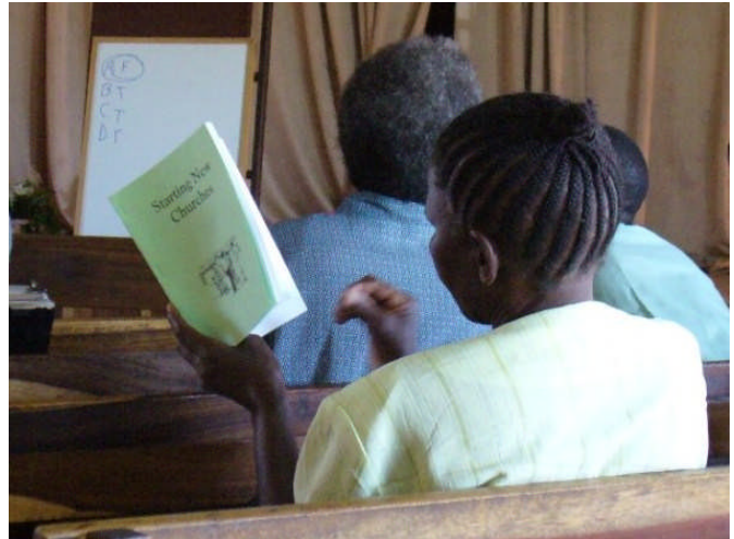
Leader reading course "Starting New Churches"