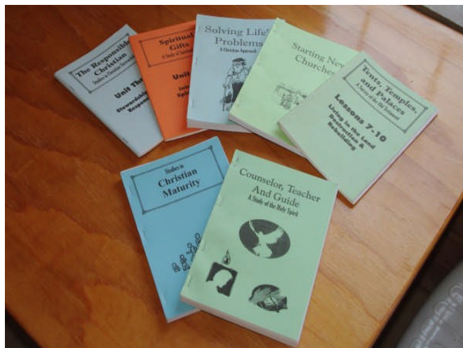
A few of the set of 18 Christian Service books