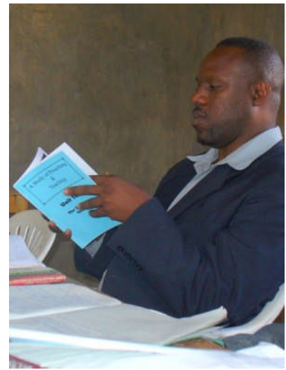
Leaders studying Christian service books in various centers around Zambia